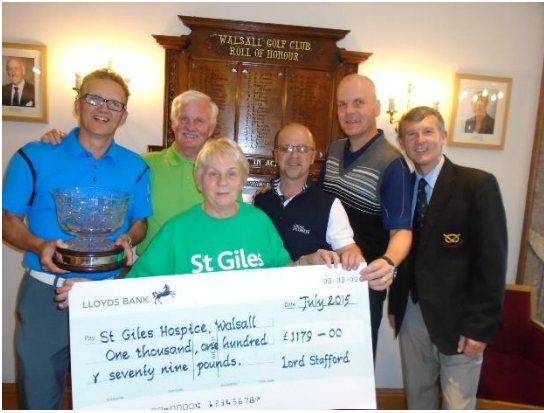
Lord Stafford Charity Golf Day 24 th June at South Staffs GC. Entry